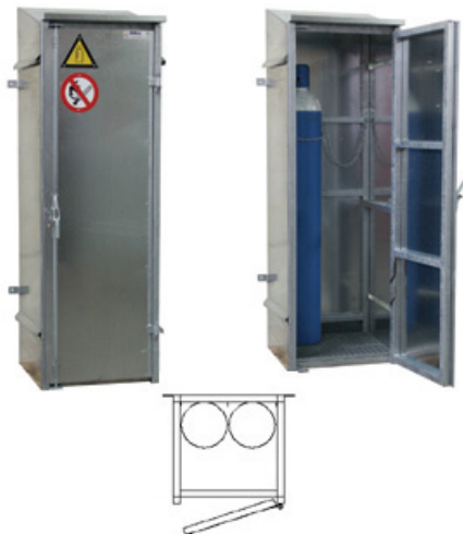
Size Gas bottle facade cabinet model GK 2