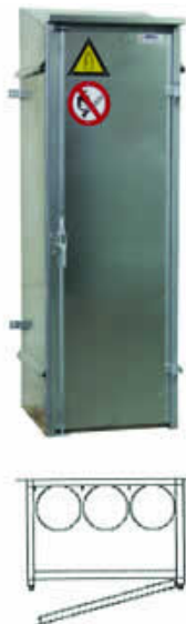
Size Gas bottle facade cabinet model GK 3