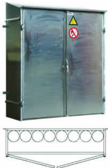
Size Gas bottle facade cabinet model GK 8