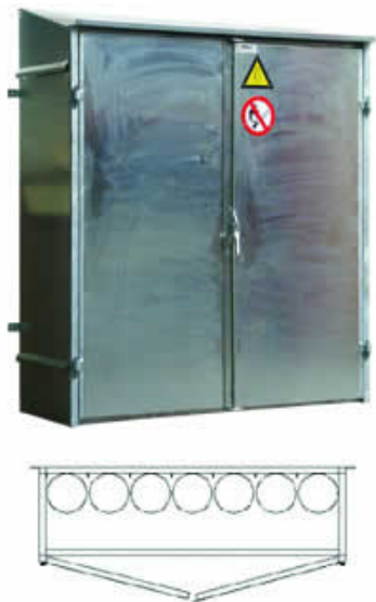
Size Gas bottle facade cabinet model GK 7

Created on: 14-06-2025 07:48:01 | Technical changes and imperfections reserved.