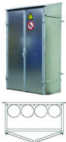
Size Gas bottle facade cabinet model GK 4